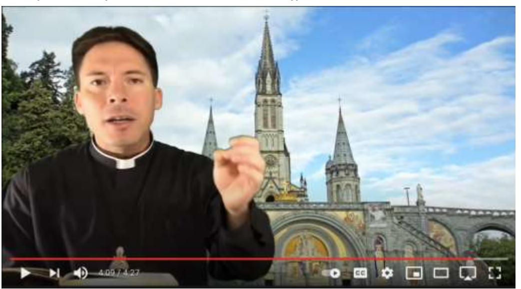
Check it out: https://www.youtube.com/watch?v=zcHv6FjpRmU

Please note another inspiring video THE BLESSING AUSTRALIA can be viewed at: https://youtu.be/OOt7baaVSbE